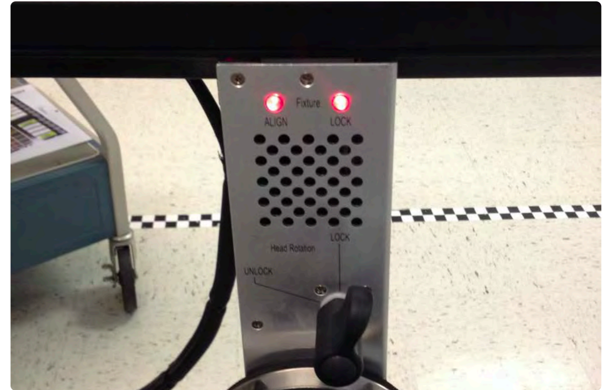
FIGURE 1.47 FIXTURE DOCKING INDICATOR LIGHTS

The docking indicator lights are located on the side of the test head nearest the infrastructure chassis. When the test head is powered up and active but no fixture or calibration/diagnostic plate is present both LEDs are red.